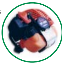
New steel guard protects fuel tank & recoil assembly

The engine has two piston rings and a stress relieved, chrome-plated cylinder for long service life. The