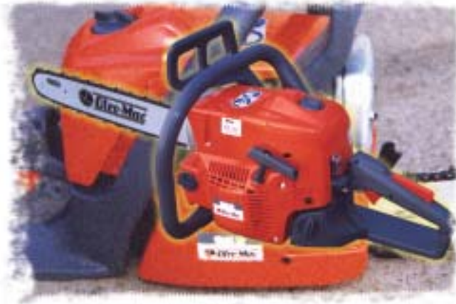
The 952 is one of the latest chainsaws in Oleo-Mac's upgraded range.

And, power to get the job done—usable power—has been greatly increased. More torque