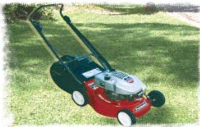
The PCL 6510 "Cassowary" walkbehind mower—the most powerful in the range, features a 6.5 hp Tecumseh OHV commercial four stroke engine.

Ideal for the mowing contractor, the Cassowary features a large capacity, extra thick roll-formed catcher, with