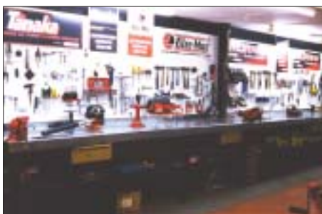
Parklands recently renovated workshop

We have restructured our product update seminars and service schools. These sessions, to be held at selected state-wide venues, are highly effective, giving our dealers an added weapon in the armoury. With the many products that have come on stream, these seminars are now more important than ever.